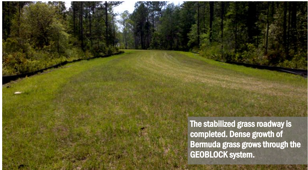
The stabilized grass roadway is completed. Dense growth of Bermuda grass grows through the GEOBLOCK system.

The two parking areas will be used as overflow parking for employees at the center.