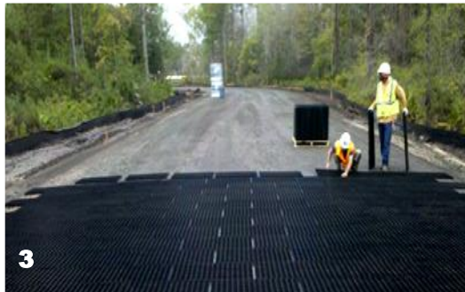
Photo 1: Prepared engineered base Photos 2-3: GEOBLOCK units are installed and ready for placement of topsoil infill

Project information and material provided by Presto Geosystems' distributor RH Moore & Associates, Tampa, FL.